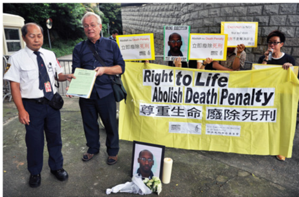
© LAURENT FIEVET/AFP via Getty Images. All rights reserved. This content is excluded from our Creative Commons license. For more information, see https://ocw.mit.edu/help/faq-fair-use/ .

Vague consensus on rights masks major differences in definition