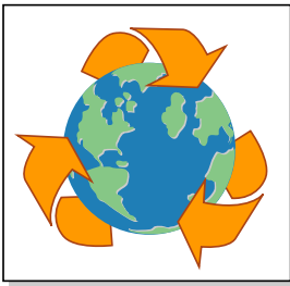
Figure by MIT OCW.