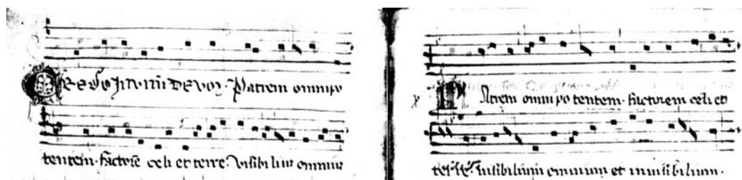
FIGURE 1.22: DETAIL OF CREDO FROM VATICAN 657, FF. 419V–20R. 29

This movement is perfectly homophonic for the first two lines of music and nearly perfect following. The phrases have a tendency to use longer note values at the beginning and ends, and semibreves and minims in the middle and before cadences. 30 Some pieces of homophonic polyphony, such as the first Credo of Parma 9 (ff. A–D. Cardinalis) even accelerate from their opening longs, through breves, to semibreves, and finally minims before allowing the notes to occur in other orders.