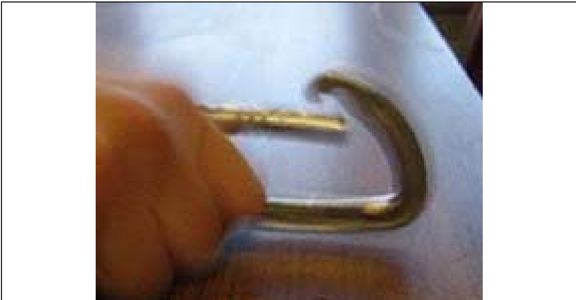
Figure 2 Video frame with carabiner gate open