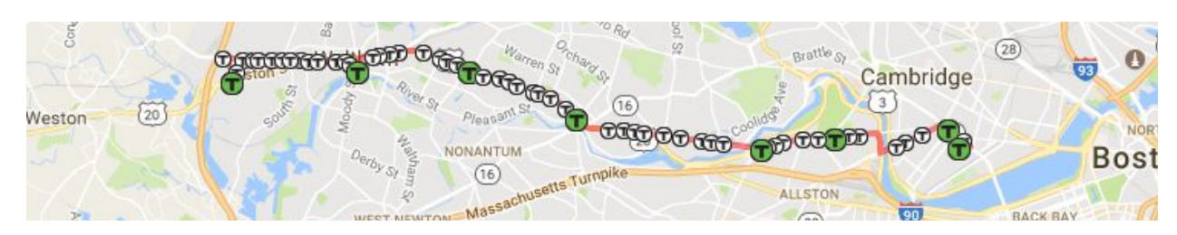
Figure 1: Route 70

The MBTA bus lines 70 and 70A run between Waltham and Central Square in Cambridge, as shown in the maps below.