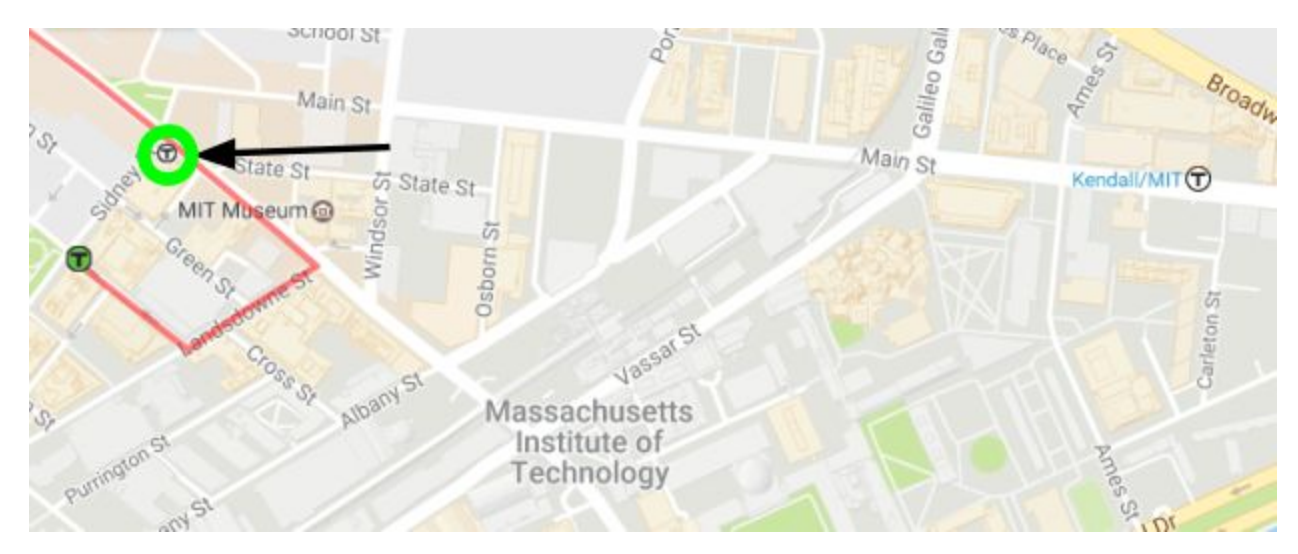
Figure 3: Data Collection Site

Data should be collected from 7:30 to 9:30 on a non-holiday weekday. The stop of interest is Massachusetts Ave. at Sydney St., only in the inbound direction, shown in the map below with an arrow and circled in green.