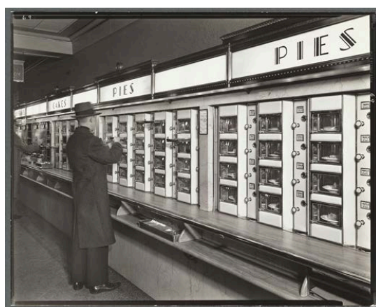
Berenice Abbott, Automat , 977 Eighth Avenue, 1936. Courtesy of the New York Public Library This image is in the public domain.

Taken only a year apart but providing a stark contrast to the rustic streetscapes is Abbott's Automat , where a figure is standing in front of gleaming, almost clinical, rows of glass cabinets, each offering meals from which customers could choose.