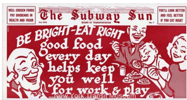
The Subway Sun , Vol. XVII, No. 7: Be Bright - Eat Right , 1950

as the city grew larger and order needed to be enforced. The playful cartoon format that delivered instructions that riders were expected to obey was not from a direct boss or superior but was still agreed upon by the public. These messages extended into the private life as well, as in the example below where adults and children alike were taught that food was essential to be a healthy and functional being for “work and play”.