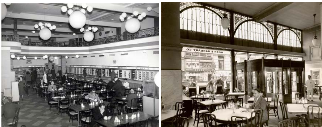
Left: The interior of the Horn & Hardart Automat branch at 1165 Sixth Avenue, circa 1912. This image is in the public domain. Right: 115 East 14 St. Automat, 1935.

human connection. The paradox of city life was that amidst the constant interactions with other people and the formation of communities, there were more moments of solitude and emotional distance, similar to what Edward Hopper references in the detached atmosphere of his paintings.