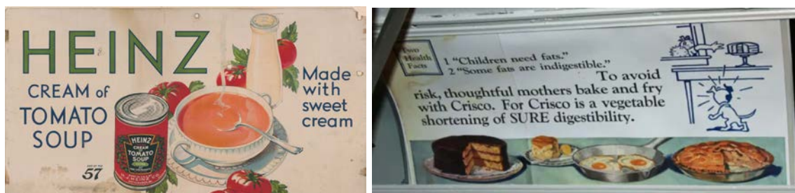
Food advertising posters, New York Transit Museum Archives. Photos © New York Transit Museum; left advertisement © Kraft Heinz; right advertisement © Procter & Gamble. All rights reserved. This content is excluded from our Creative Commons license. For more information, see https://ocw.mit.edu/help/faq-fair-use/ .

A key feature within subways was the advertisements on platforms and in cars. These visual components contained ideas of food and uniformity that followed New Yorkers on their way to and from work. Advertisements at the time “tapped a very deep American insecurity and deadly pressure to conform by equating consumption of an article with social status and approval” (Norris 1990). By constantly being surrounded by imagery dictating proper food norms, riders on public transit systems would inevitably be influenced into making choices similar to others. Mass-produced pre-packaged food took off at the beginning of the 20th century, offering urban dwellers options that appealed to their desires for convenience and social acceptance.