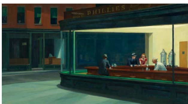
Edward Hopper, Nighthawks, 1942.

Some of the most iconic imagery of modern American urban life in the first half of the twentieth century are the paintings of American realism painter Edward Hopper. His most recognizable work, Nighthawks (1942), depicts four customers and a waiter inside a brightly lit New York City diner at night. Another well-known painting from earlier on in his career is Automat (1927), where a woman is sitting alone with a cup of coffee in an automat at night. While the urban settings of Hopper's paintings are central locations of human gatherings, like restaurants, movie theaters, and public transit cars, there is a strongly present overtone of loneliness and melancholy. The paintings provide a glimpse into contemporary life and hint at the social milieu, where “unconsciously, probably, [Hopper] was painting the loneliness of a large city” (Hopper). Especially in an era marked by the boom of urban culture in the 1920s, a sudden crisis during the Depression, and the revitalization in subsequent decades, this transitory nature of personal identity in a city draws attention to how urban spaces developed to accommodate these interactions between residents. Food settings are strong examples to illustrate features of social norms because of the intricate communal and hierarchical nature of dynamics embedded into the act of a meal.