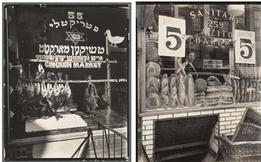
Left: Berenice Abbott, Chicken Market , 1937. Right: Berenice Abbott, Bread Store , 259 Bleecker, 1937. Courtesy of The New York Public Library These images are in the public domain.

Taken only a year apart but providing a stark contrast to the rustic streetscapes is Abbott's Automat , where a figure is standing in front of gleaming, almost clinical, rows of glass cabinets, each offering meals from which customers could choose.