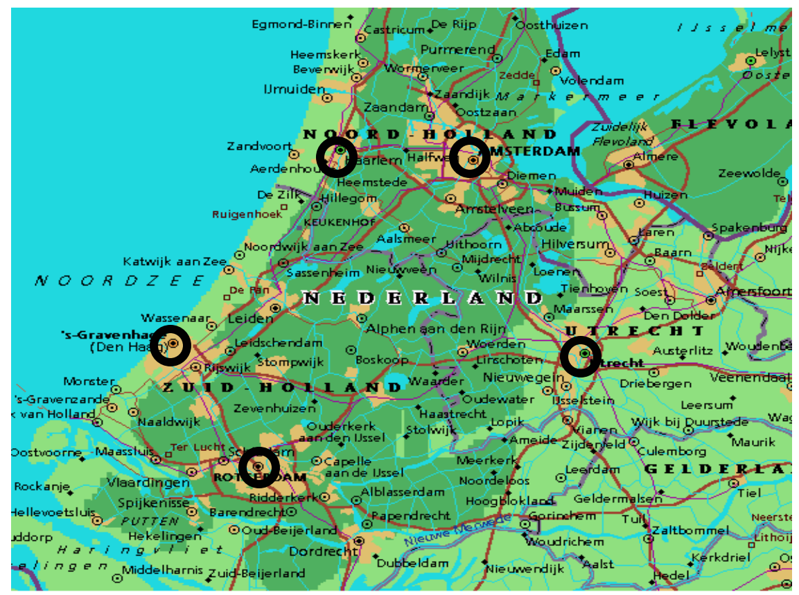
Copyright © 1999 by Wolters-Noordhoff. All rights reserved.