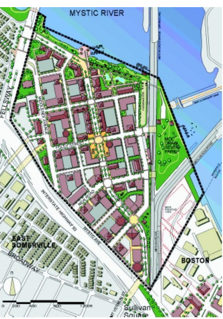
ong term potentia

* All taxes are in year 2000 equivalent dollars