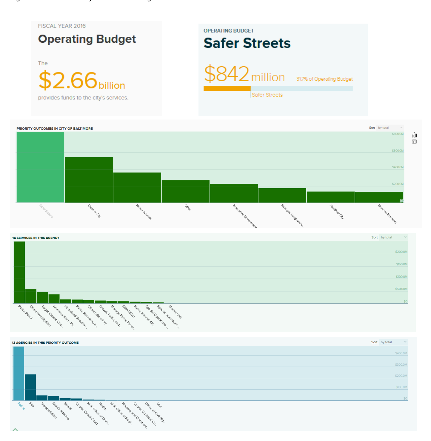
Figure 2: Baltimore City FY2016 Funding Breakdown