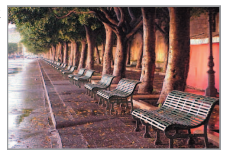
Street furniture and landscaping

entrance to the Gerena School parking lot, narrowed traffic lanes, and the opening of Birnie to two-way traffic between Arch Street and the Gerena School would help slow traffic particularly during school hours. With such safety and movement improvements, including finding alternative parking spaces, The Campus may someday be able to expand onto Birnie Avenue, where footbridges from Plainfield could lead to expanded Campus facilities such as an independent Teen Center and overflow community gardens.