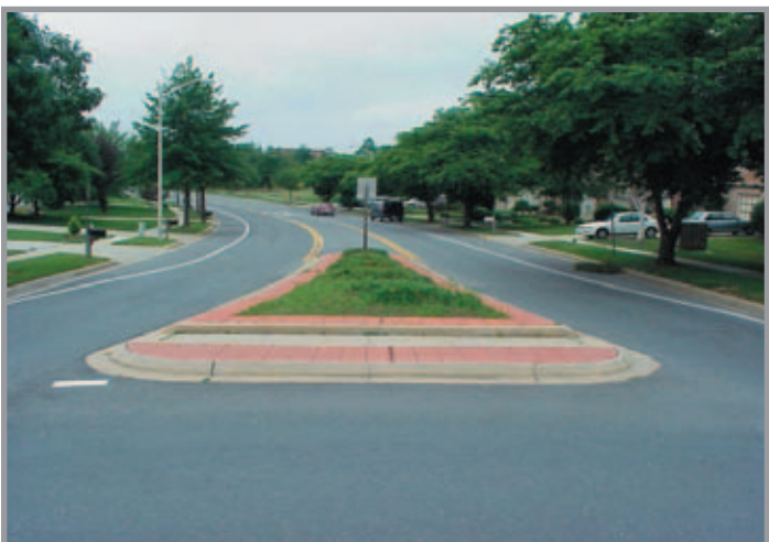
Raised median with greenery

School. Signage should direct users to The Campus resources they are looking for. Street trees and other greenery will help make the trip pleasant. Street furniture will offer welcome respites to the elderly and disabled and create gathering spaces throughout The Campus. Regularly placed trash receptacles will help keep The Campus clean.