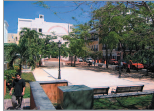
Plaza in San Juan,

The Campus is a cohesive pedestrian place where a visitor can walk from any part to another along the Thomas Street spine. All spaces within The Campus are within a 10- to 15-minute walk from all other spaces. People should feel that getting around The Campus is easy and pleasant. This can be accomplished through streetscape and traffic calming improvements along key vehicular and pedestrian routes within The Campus. These improvements should have a consistent appearance to make navigation between different places easier, including a simulation of a streetscape within the Gerena