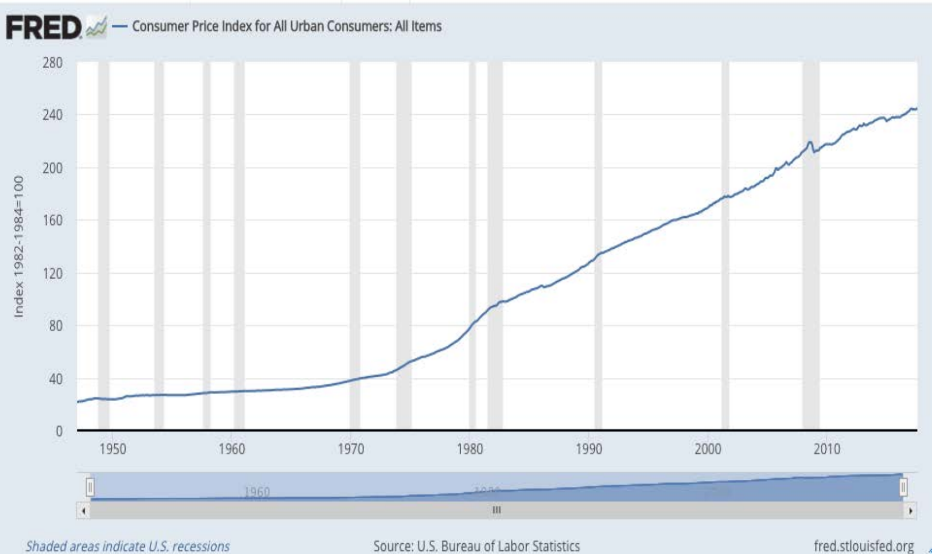
Figure 17-1: Historical CPI Graph