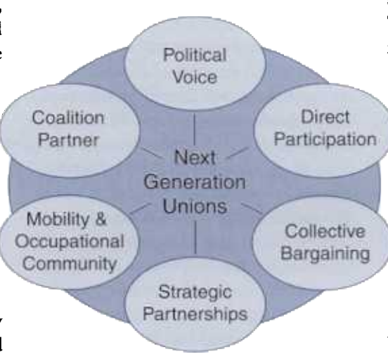
Figure 2 Multiple Purposes of the Next Generation Unions

These different functions may not necessarily be performed by the same organizations. There might be specialization, core competencies, if you will. Some unions may choose to organize in traditional ways, relying on traditional employee motivations, while new organizations, professional associations, networks, etc., grow up that recruit, represent, and service members in new ways. I believe this would be a secondbest solution. But if this is the case, then there must be active strategies for linking and cooperating across these different boundaries and mutual respect among and support among the different organizations in the network—unions, professional organizations, others yet to be named or invented. Or we might see the