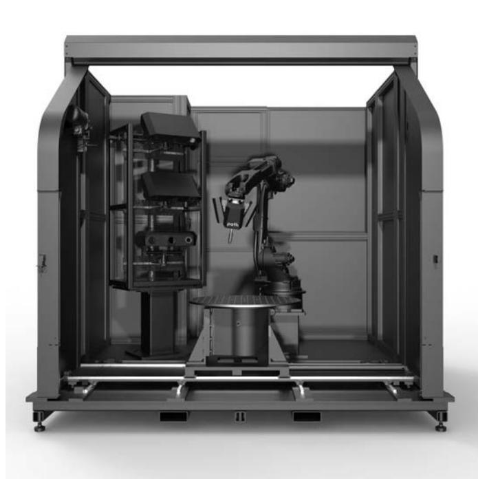
Figure 1: Path Robotics Automated Welder and Inspector

To accommodate increasing demand of 150 parts/day now, management purchases a new Path Robotics system (Figure 1) that has speedy automation to replace the 3 manual welders, a vision system to make the inspector unnecessary, and because of the excellent precision quality, does not require any post-process testing either. The reliability and operational metrics are listed below along with the same bending and machining step.