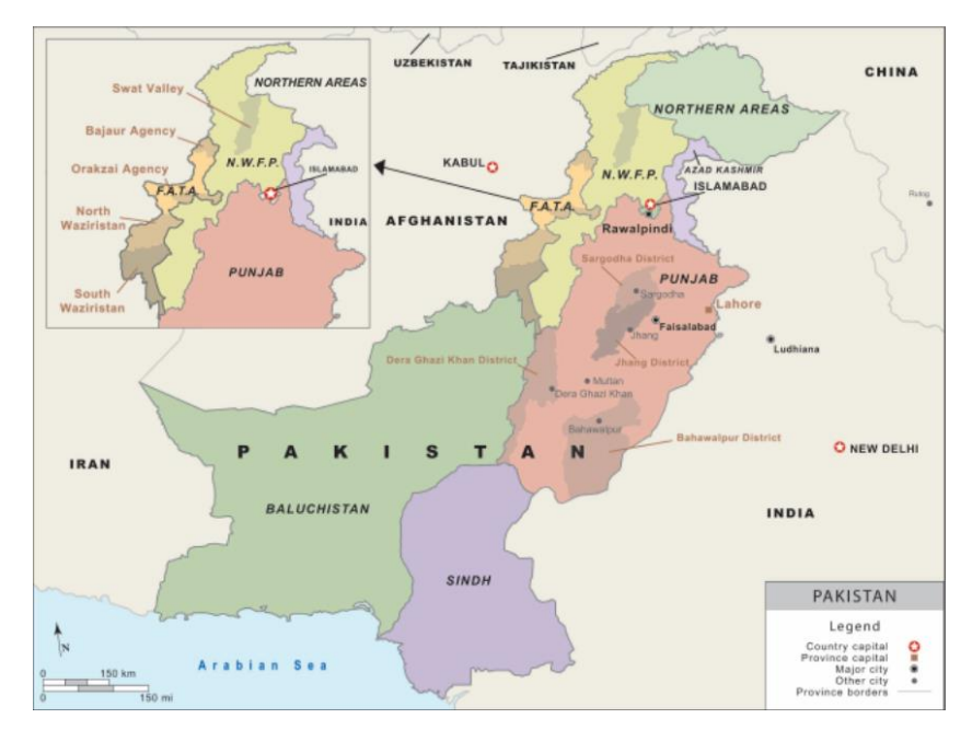
Majidyar, Ahmad. "Could the Taliban Take Over Pakistan's Punjab Province?" Middle Eastern Outlook: American Enterprise Institute for Policy Research 2 (2010): 1 - 8. © American Enterprise Institute for Policy Research. All rights reserved. This content is excluded from our Creative Commons license. For more information, see <a href="http://ocw.mit.edu/help/fag-fair-use/">http://ocw.mit.edu/help/fag-fair-use/</a>.