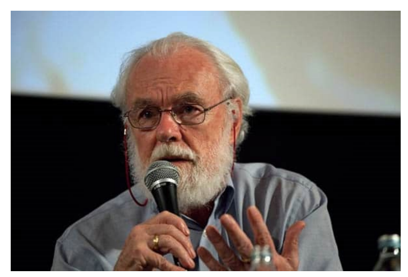
Image by Robert Crc. This image is in the public domain. Source: Wikimedia Commons.

argues there has been a shift from a post WWII FORDIST/KEYNSIAN regime to one of FLEXIBLE ACCUMULATION beginning in 1973