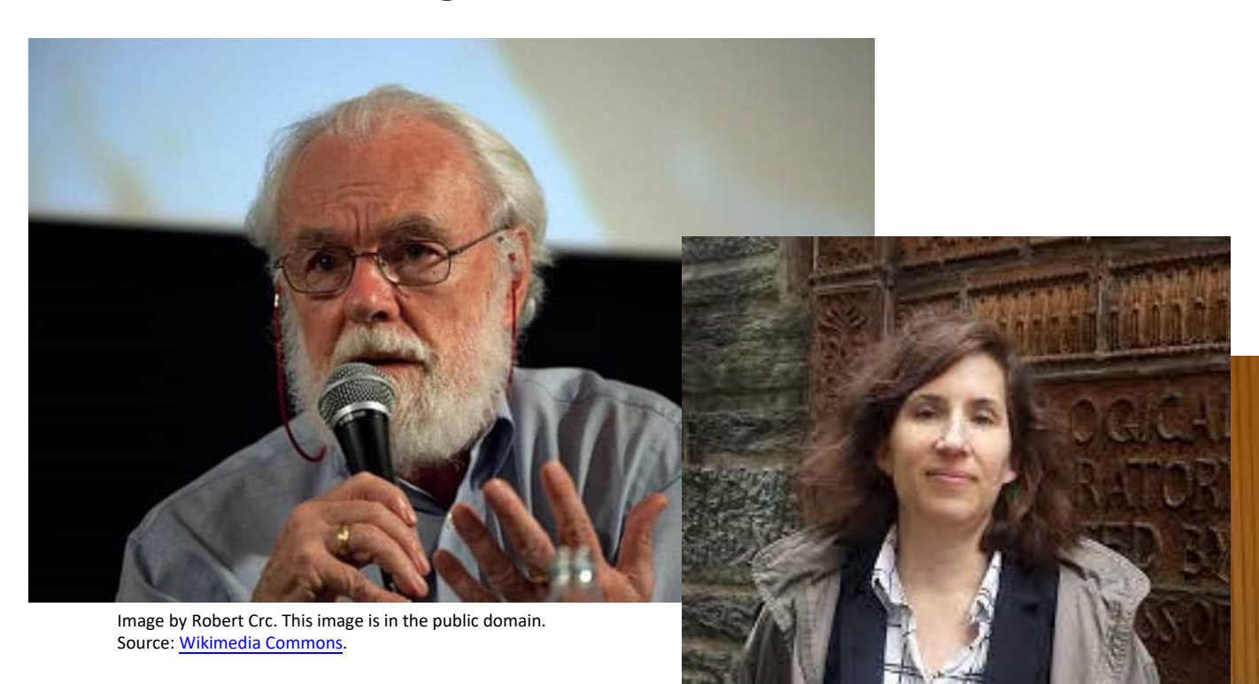
© UC Regents. All rights reserved. This content is excluded from our Creative Commons license. For more information, see https://ocw.mit.edu/help/faq-fair-use/.