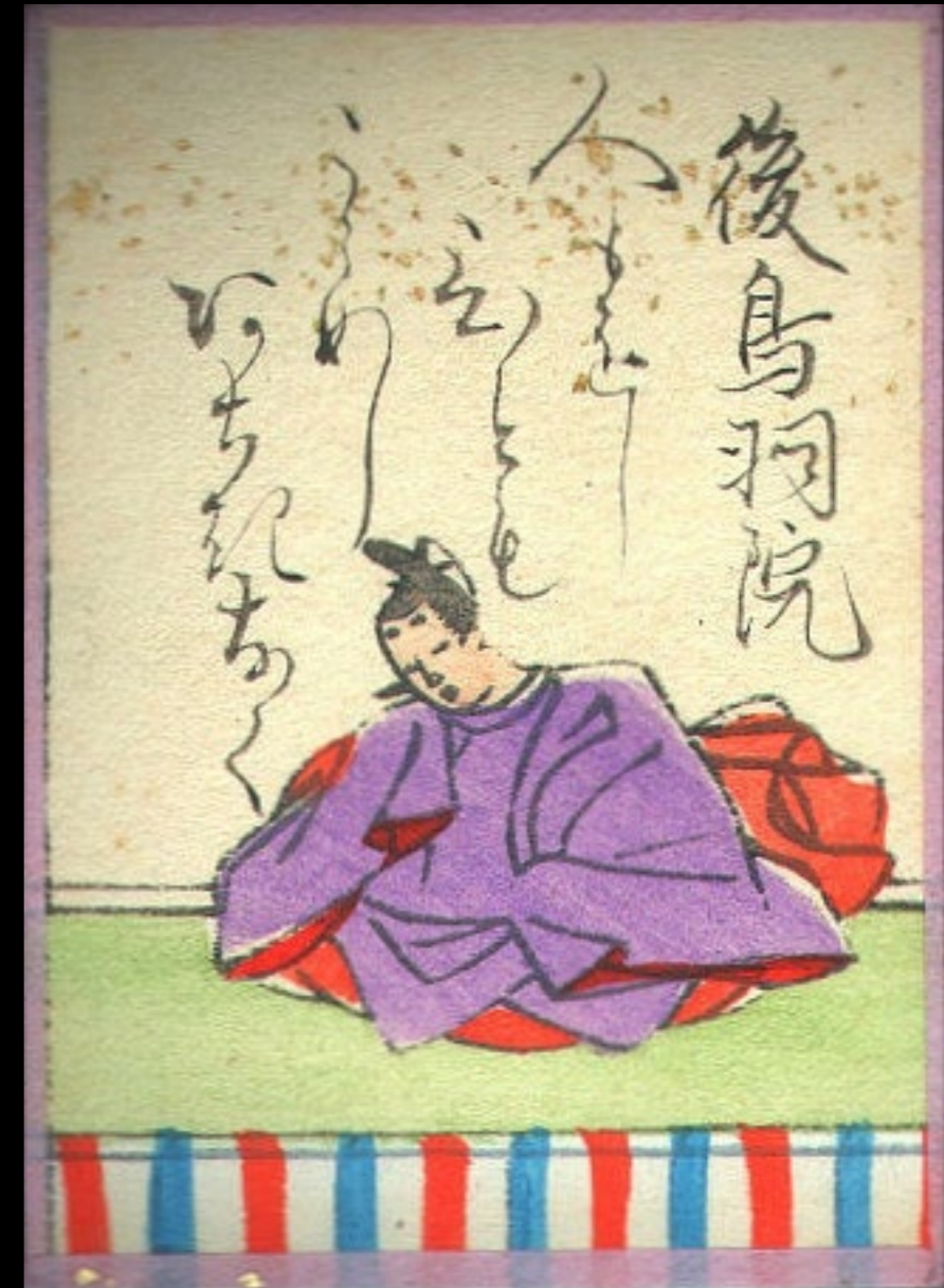
This image is in the public domain. Source: Wikimedia Commons .