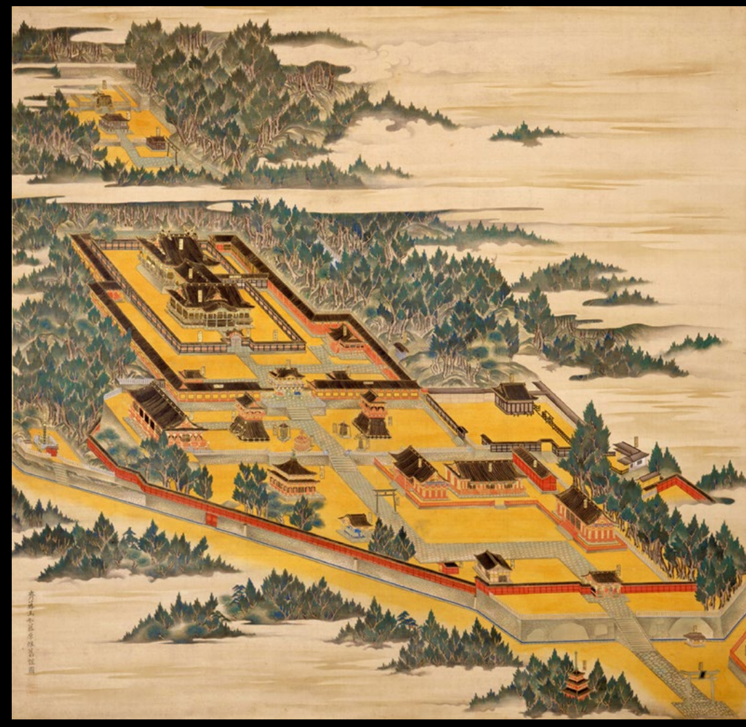
© Source unknown. All rights reserved. This content is excluded from our Creative Commons license. For more information, see <u>https://ocw.mit.edu/help/faq-fair-use/</u>.