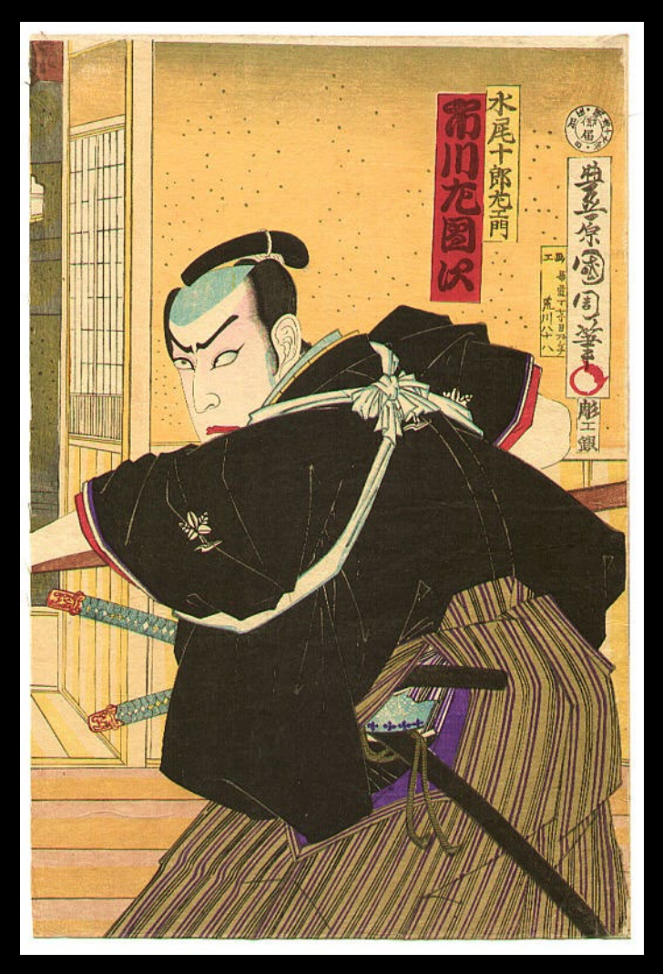
This image is in the public domain. Source: Wikimedia Commons.

An 1884 print of a kabuki actor as a "hatamoto ruffian" (hatamoto yakko )