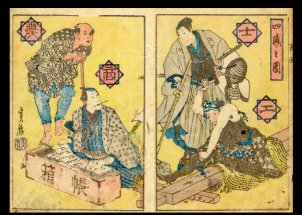
© Source unknown. All rights reserved. This content is excluded from our Creative Commons license. For more information, see <a href="https://ocw.mit.edu/help/faq-fair-use/">https://ocw.mit.edu/help/faq-fair-use/</a>.