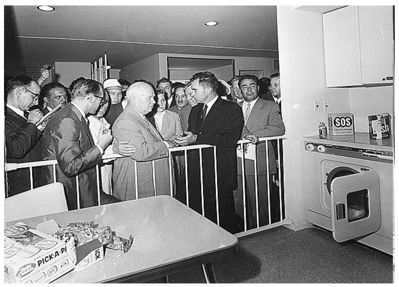
This image is in the public domain.