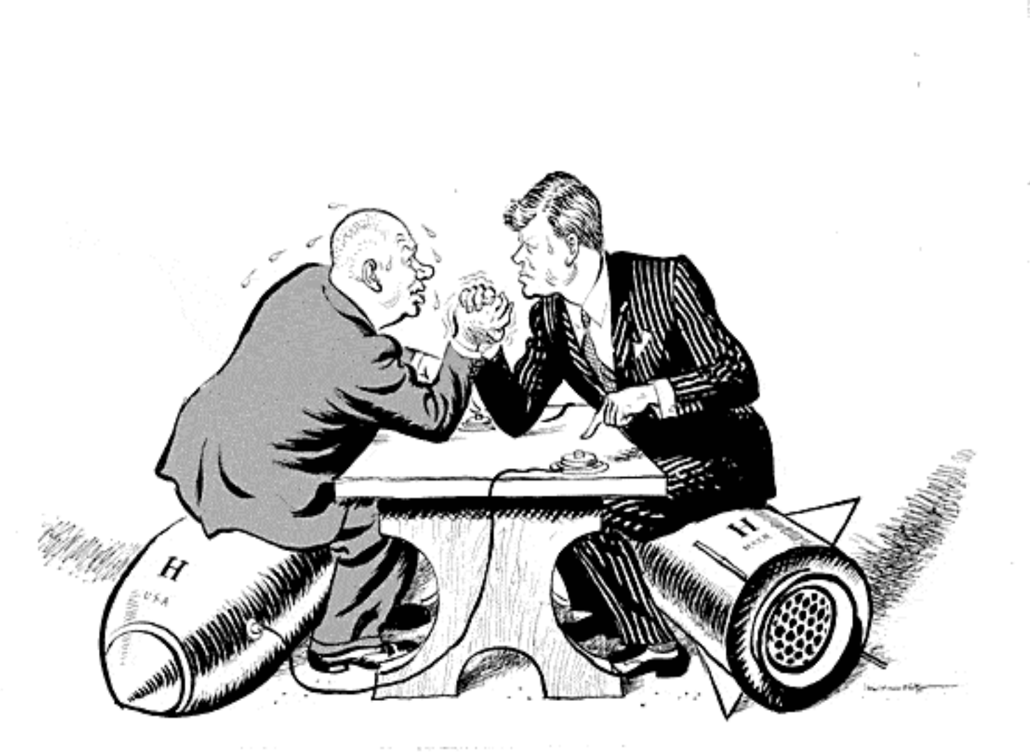
© Source unknown. All rights reserved. This content is excluded from our Creative Commons license. For more information, see https://ocw.mit.edu/help/faq-fair-use/.