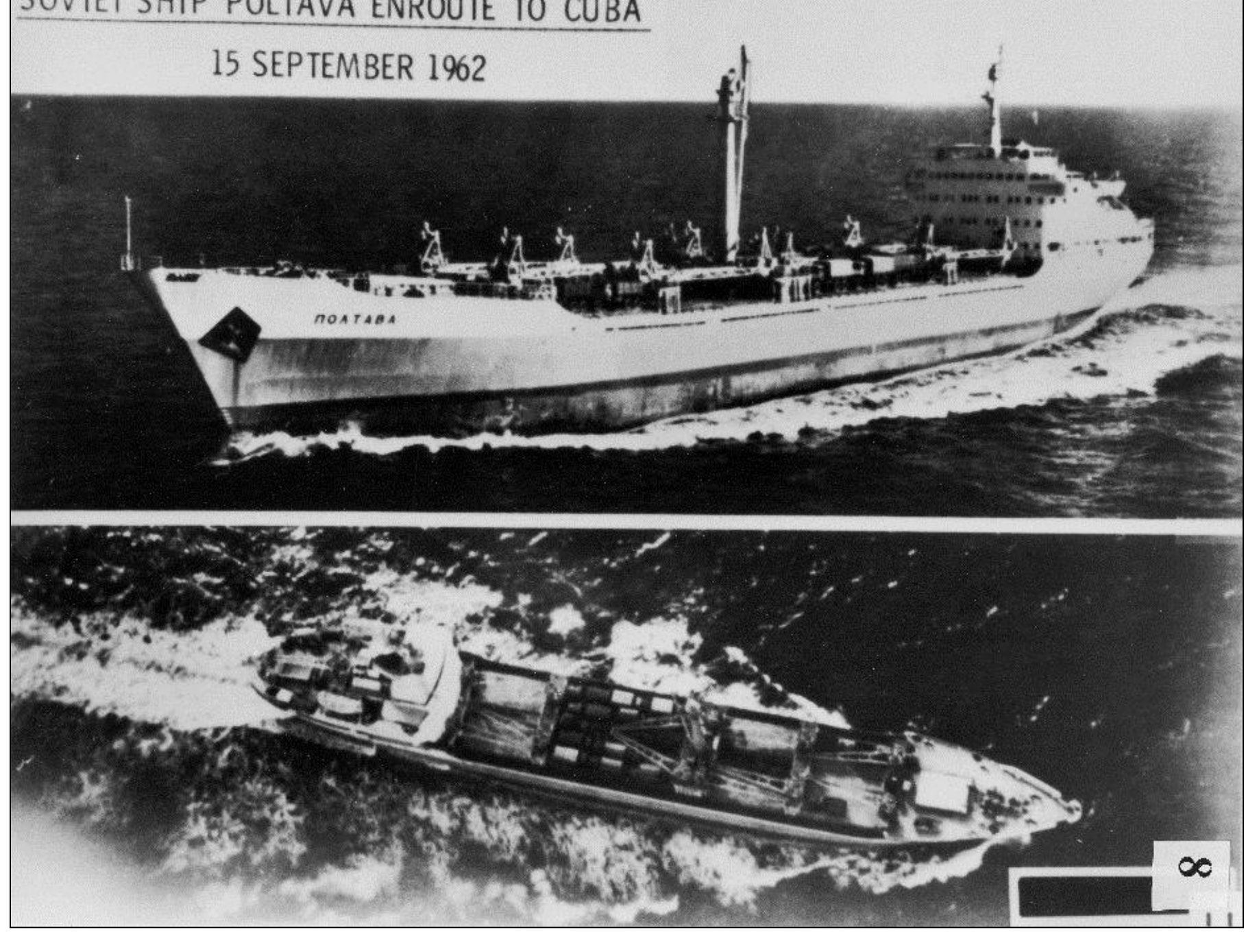
This image is in the public domain. Source: Wikimedia Commons.