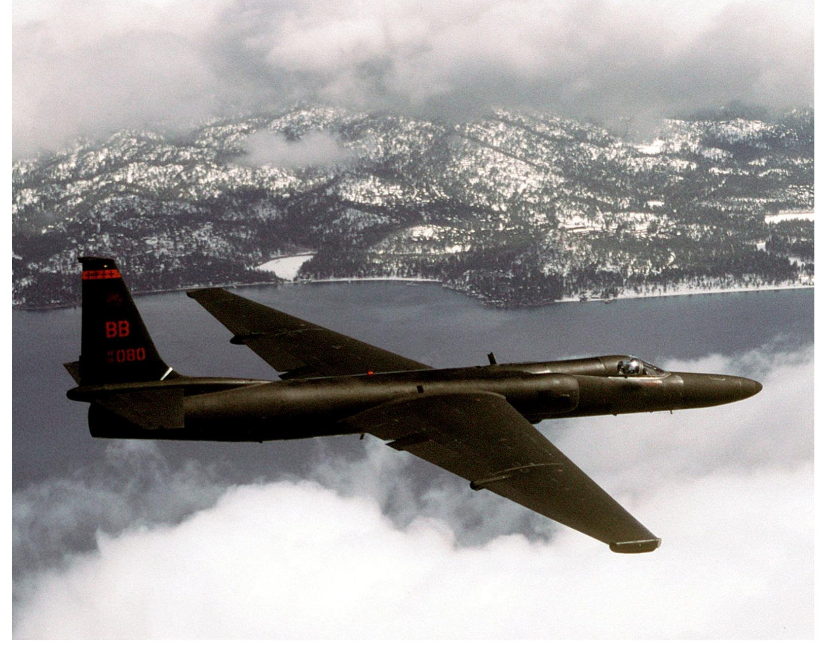
This image is in the public domain. Source: Wikimedia Commons.