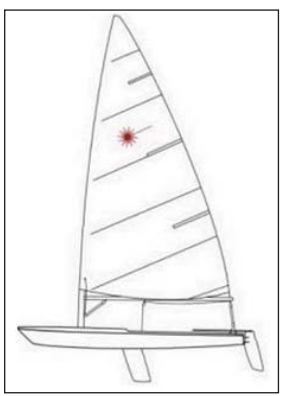
Figure 1. Laser Sailboat Diagram Taken from Google Images

To keep it relatively simple the boat I will use as a model to create sounds is a 4-meter long boat that has one main sail and is suitable for single-handed sailing, specifically the laser class sailboat. I chose this boat because I sailed lasers throughout 4 years of high school and I am very familiar with the sounds of sailing it. (See Figure 1 for image of laser)