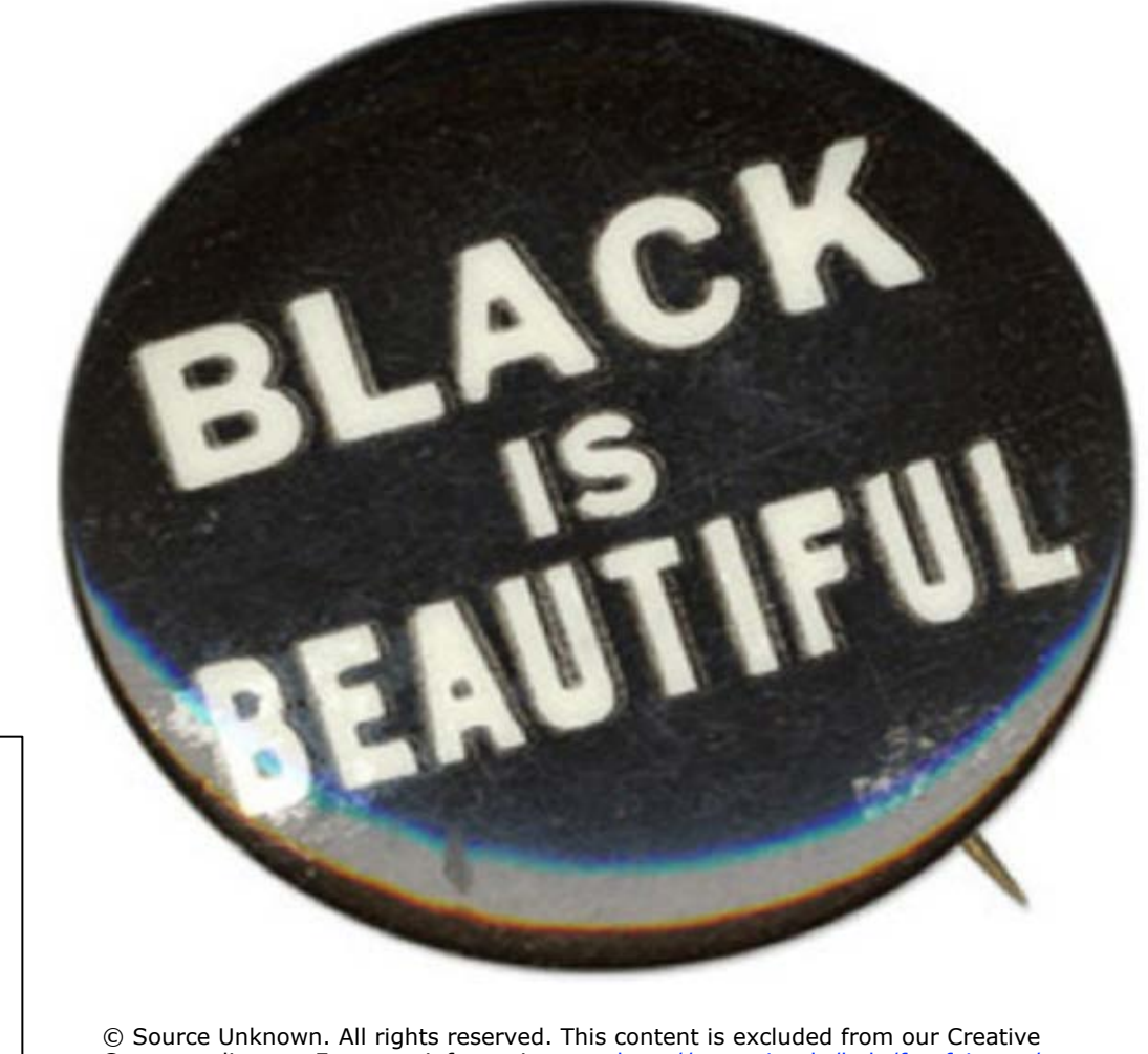
Commons license. For more information, see http://ocw.mit.edu/help/faq-fair-use/

Baldwin: "This was not merely, as in the European example, the adoption of a foreign tongue, but an alchemy that transformed ancient elements into a new language."