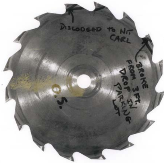
Figure 2: Subject blade, showing multiple broken teeth.