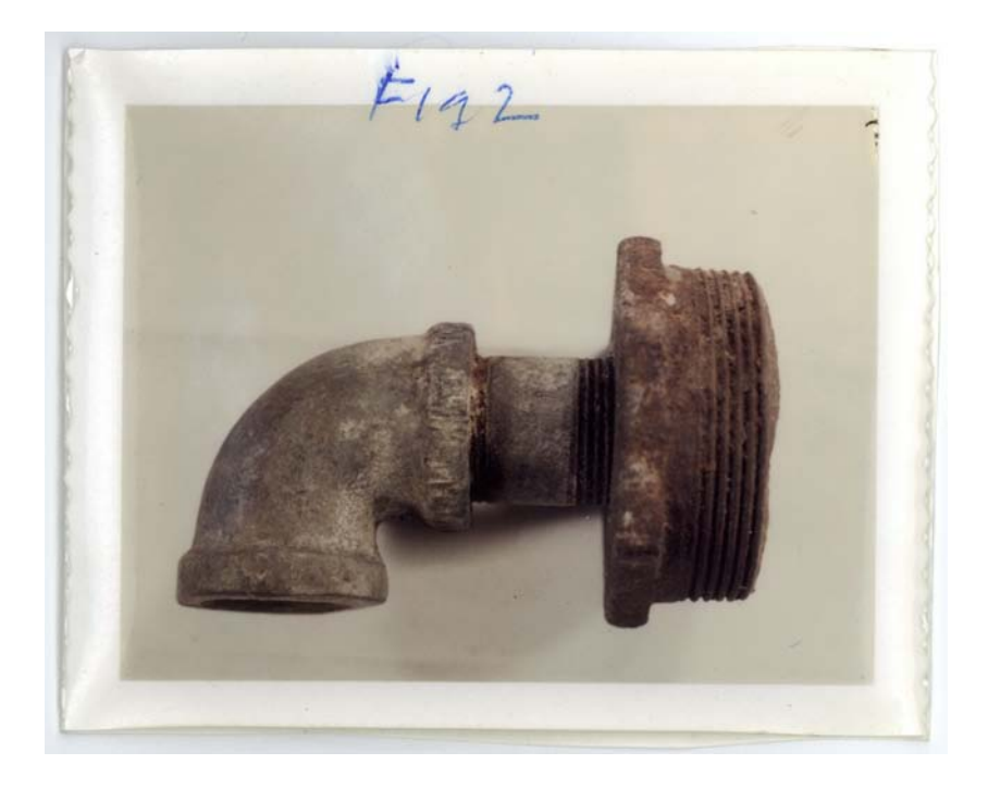
Figure 2: Failed bushing, showing corrosion.