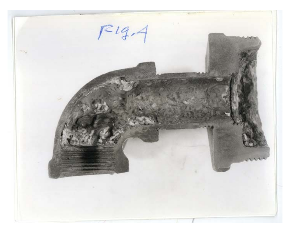
Figure 4: Sliced in half, the corroded bushing has been polished and etched.