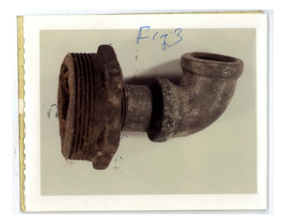
Figure 3: Failed bushing, from the other side.