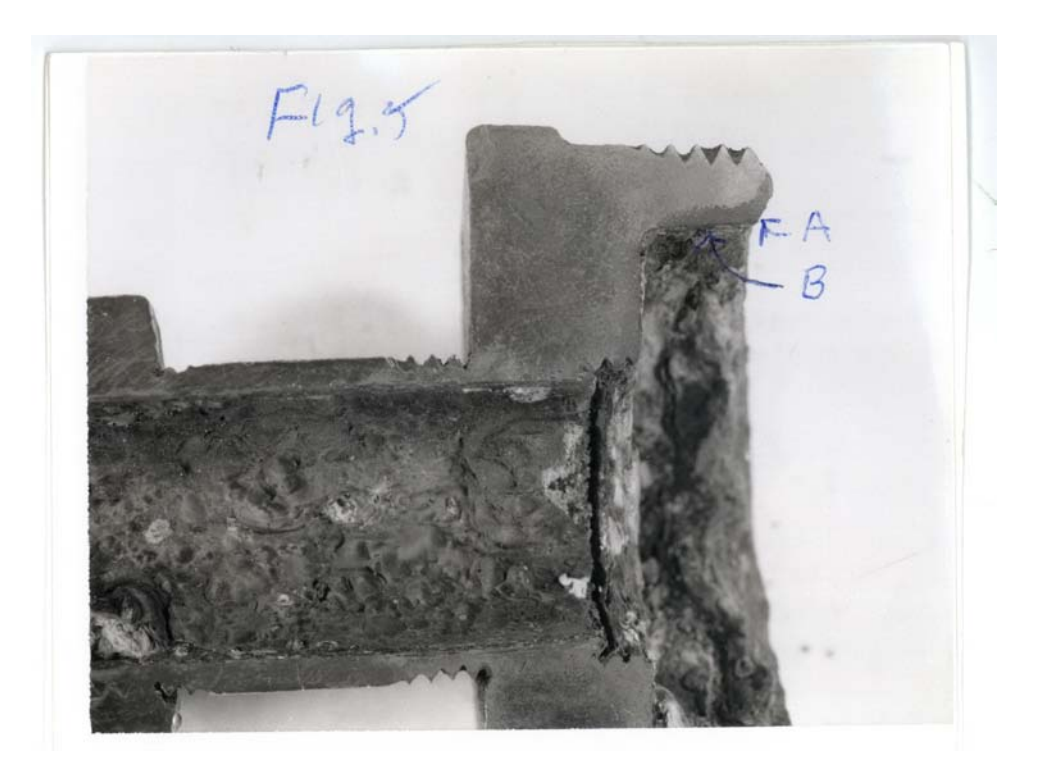
Figure 5: A closeup of the etched metal shows magnetite at the valve.