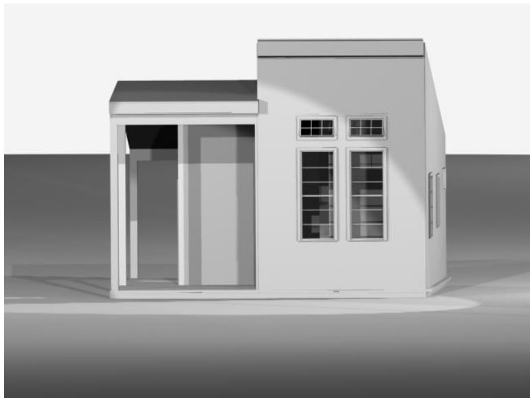
Camera 3 Front View