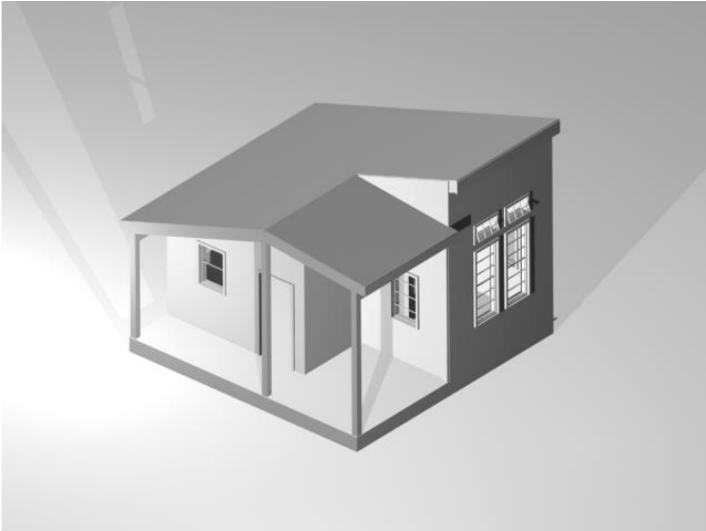
Isometric Projection Drawing