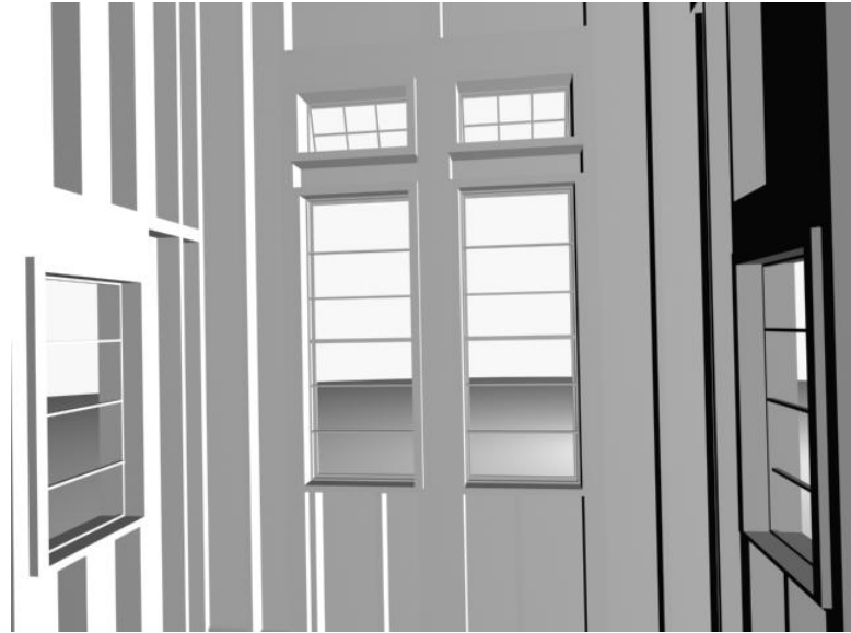
Camera 2 Interior View – Writing Room