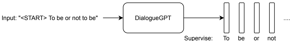
Figure 3: Illustration of GPT Loss

Suppose our vocab size is V and we have T tokens in our training example (including the start token). Then our model will output logits O \in \mathbb{R}^{T \times V} . Our loss for this example will be T - 1 individual classification losses, where using logit vector O[i] we will predict the token id for token i + 1 via cross entropy loss. This means we will not supervise the start token, nor will we use the last logit vector O[-1] . An illustration of this is shown below.