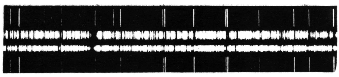
Spectra ( \lambda 4200Å to \lambda 4300Å) of the constant velocity star Arcturus taken about six months apart.

c. Use the results of parts a & b to determine the astronomical unit (in cm). You may use the fact that the length of the year is 365 days.