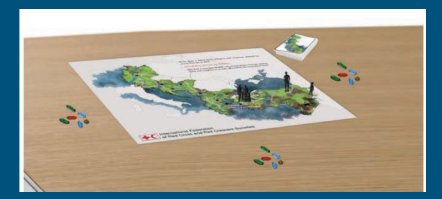
Migration Board Game (Data Studio course 2016)

Somerville Cares About Prevention.