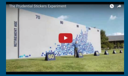
Prudential Stickers Experiment

© Prudential. All rights reserved. This content is excluded from our Creative Commons license. For more information, see <a href="http://ocw.mit.edu/help/faq-fair-use/">http://ocw.mit.edu/help/faq-fair-use/</a>