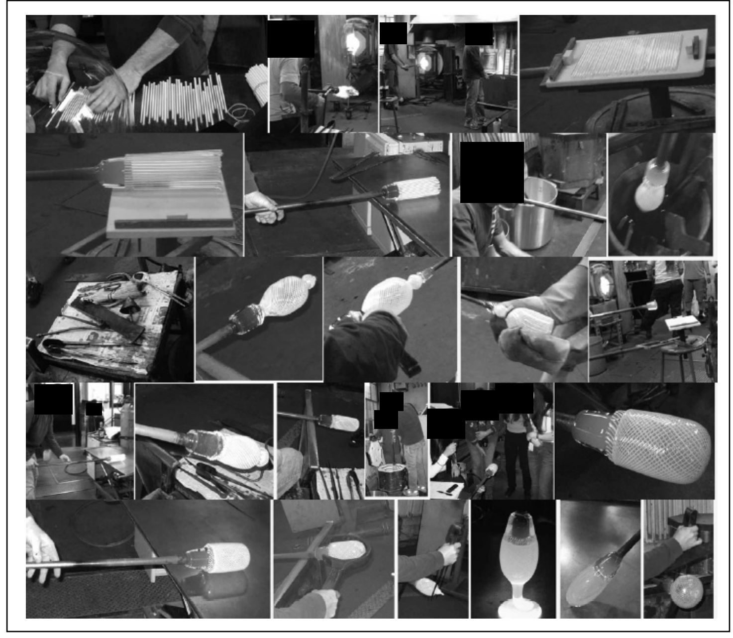
Figure by MIT OpenCourseWare.

Peter Houk lays out glass canes having a white core (1). An artist torches heat onto a glass lamp (2). Peter and Whitney work in two furnaces at once (3), coordinating the preparation of the plate of canes (4) and the glass glob that picks them up (5). Rolling the composite glob and its cane sides (6); blowpiping (7); the vessel immersed briefly in water (8); tools (9); the shaped vessel (10); its transfer to a second punti rod (11); its release from the first rod and the emergence of a lip (12); Starting the inner vessel (13); rolling, forming, shaping (14-17); placing the inner vessel within the outer (18); working the combined two layer glass form (19,20).