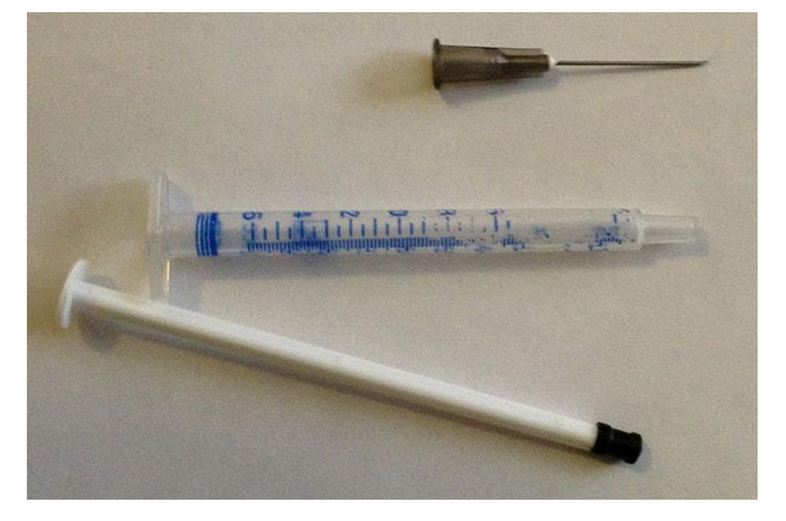
Top: needle, middle: barrel, bottom: plunger

This photo is released under a CC-BY license. Author: Zak Fallows, 2013.