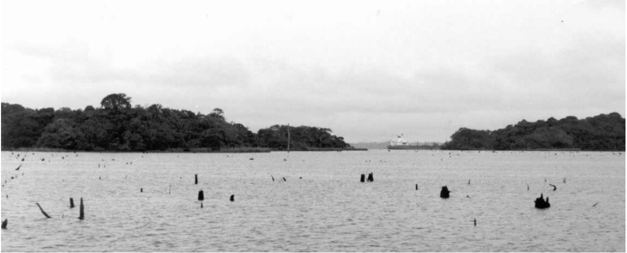
Figure 2 Lake Gatun

A vast supply of water must be available to allow operation of the locks. Lake Gatun was formed by damming the Chagres River, using the material excavated from the cut to create the dam. Stumps from the forest that was submerged under the lake are still visible, and divers visit the remains of the old Panama Railroad.