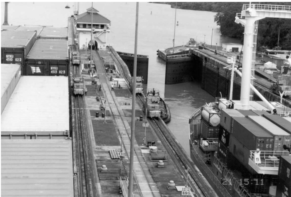
Figure 3 Pedro Miguel Lock

The capacity of the locks is limited by the average time required to move a large ship through one chamber, which is about an hour, suggesting a maximum service rate of 2 vessels per hour (since there are two parallel channels in each set of locks). Additional time is also required to position ships as they arrive at the locks and the locks must periodically be closed for routine inspections and maintenance, so the sustainable capacity drops to 37-38 vessels per day.