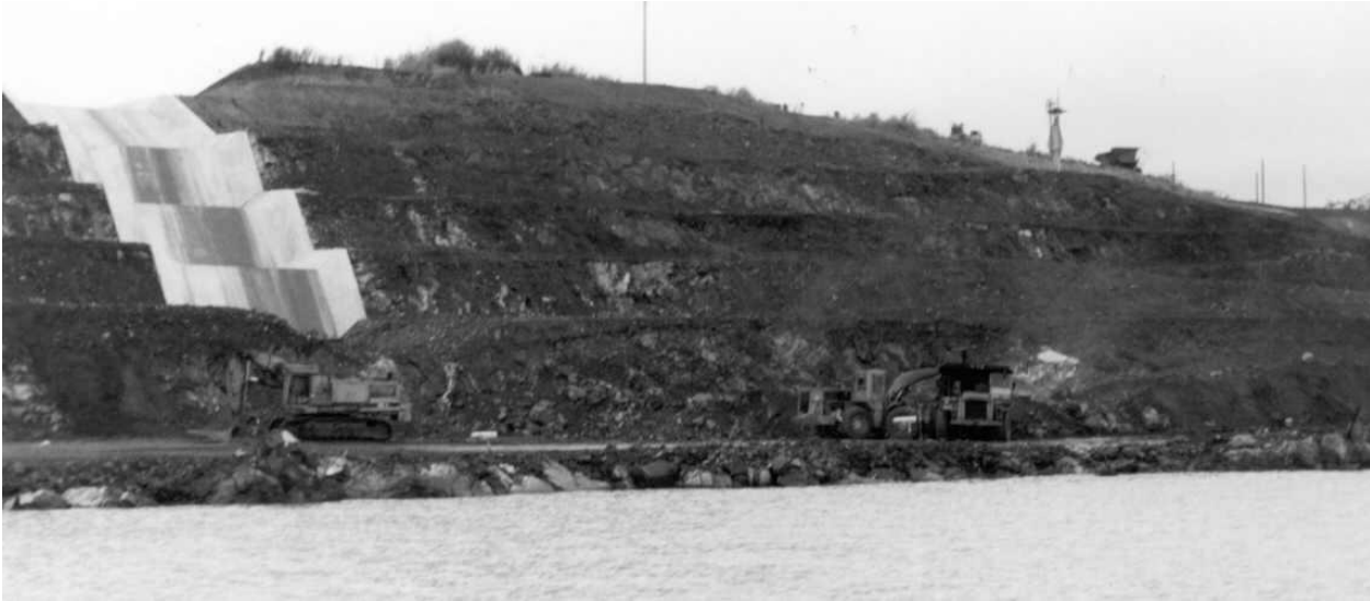
Figure 4 Widening the Gaillard Cut, 1996

This process required dredging to widen the canal, cutting back the hillsides along the cut, and providing sluices to channel water from heavy rains into the canal. The process could be accelerated by devoting more resources to the task.