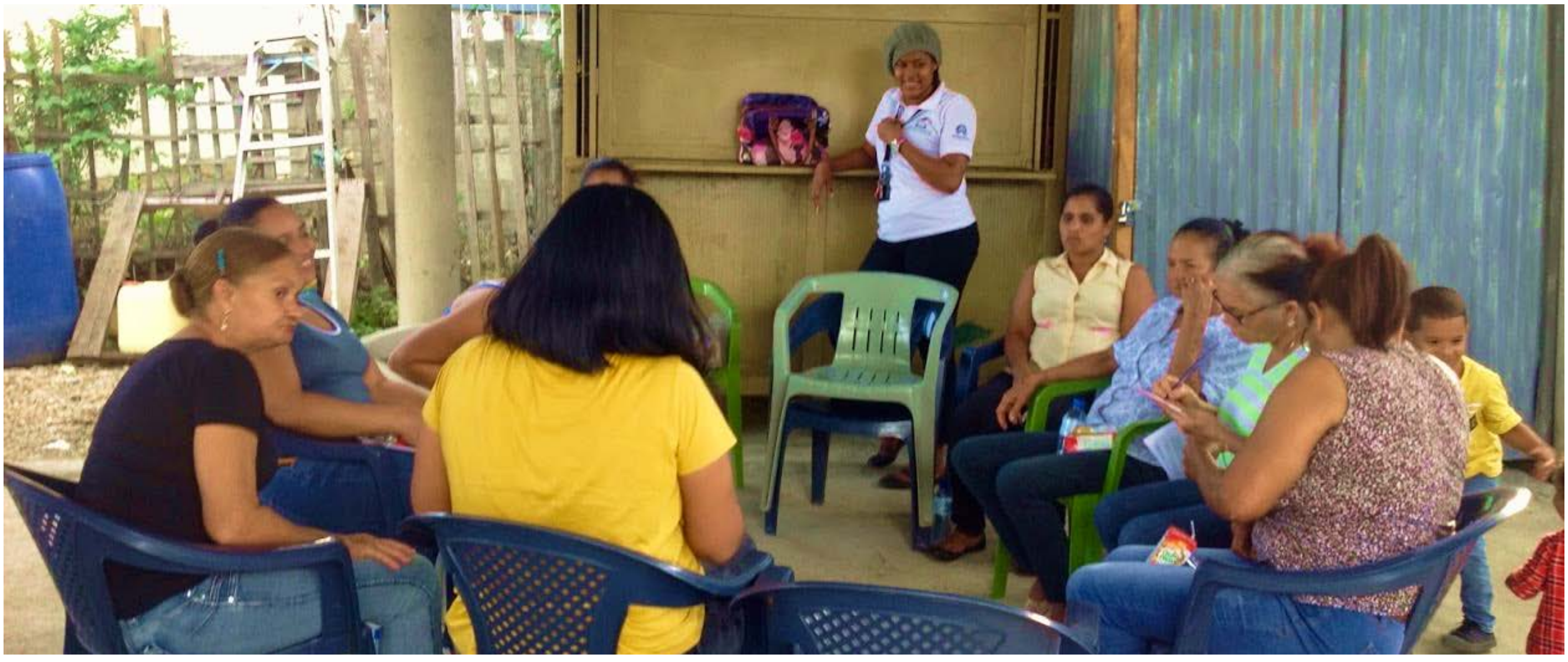
© <u>Única Mendez</u>. All rights reserved. This content is excluded from our Creative Commons license. For more information, see <a href="https://ocw.mit.edu/help/faq-fair-use/">https://ocw.mit.edu/help/faq-fair-use/</a>