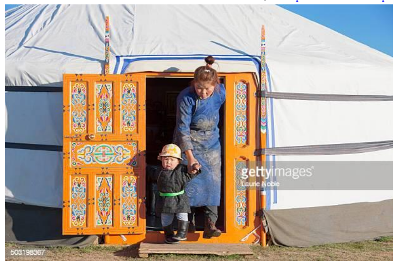
Figure 3. Mongolian Ger Door and Door frame. Mongolian Ger doors are rather small. Taken from [6].