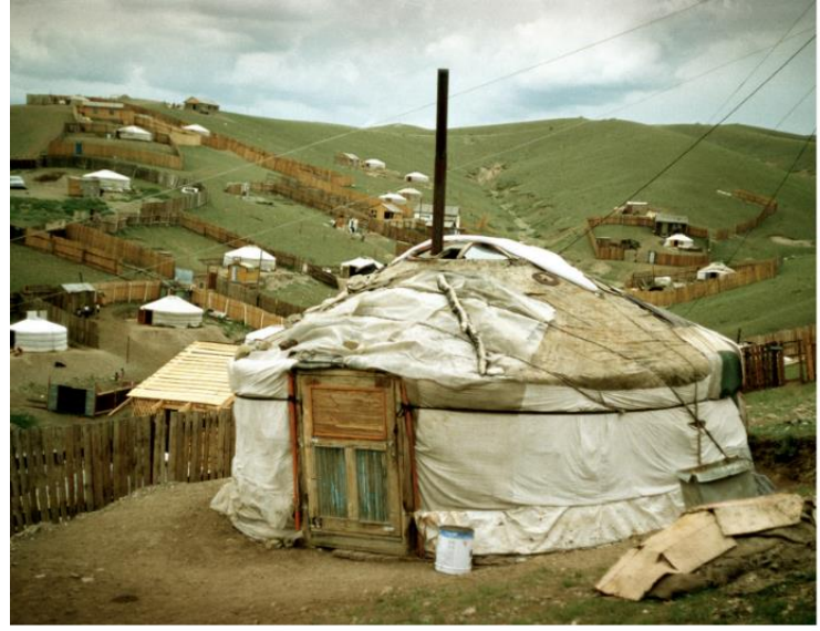
Figure 1: Dwelling on the edge of the ger districts; open pasture still crested the hills of Ulaanbaatar in 2000.

Figure 2 shows a ger and its surrounding neighborhood. Neighboring gers are located on separate tracts of land, separated by fences. Each ger has its own yard. During the day, fences may be locked, which means that deliveries of any kind would be left outside by the fence [6].